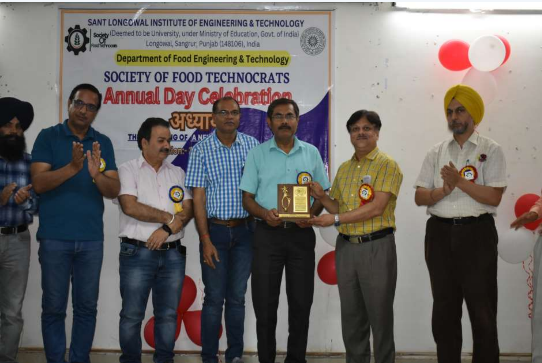
Felicitatation of Dean (SW) by the Director