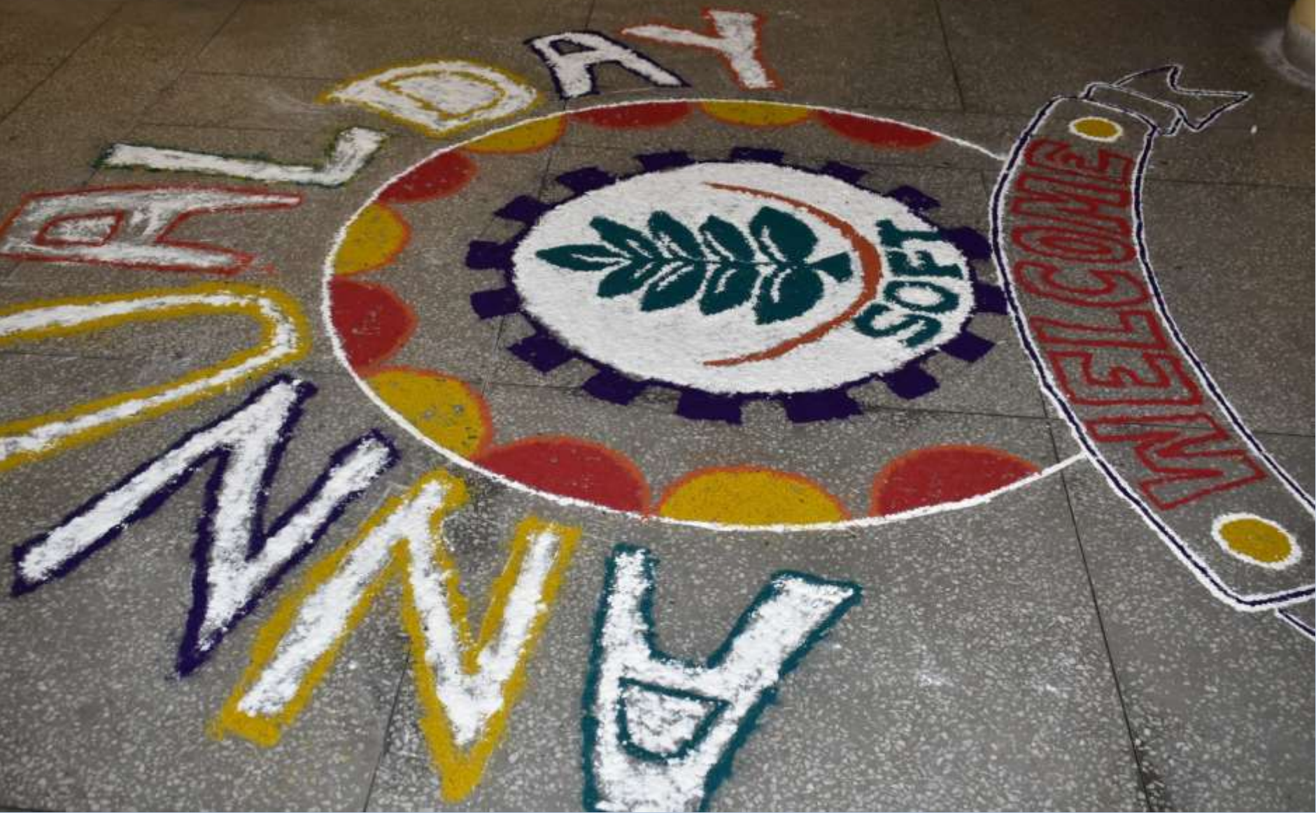
Rangoli made by the students of FET