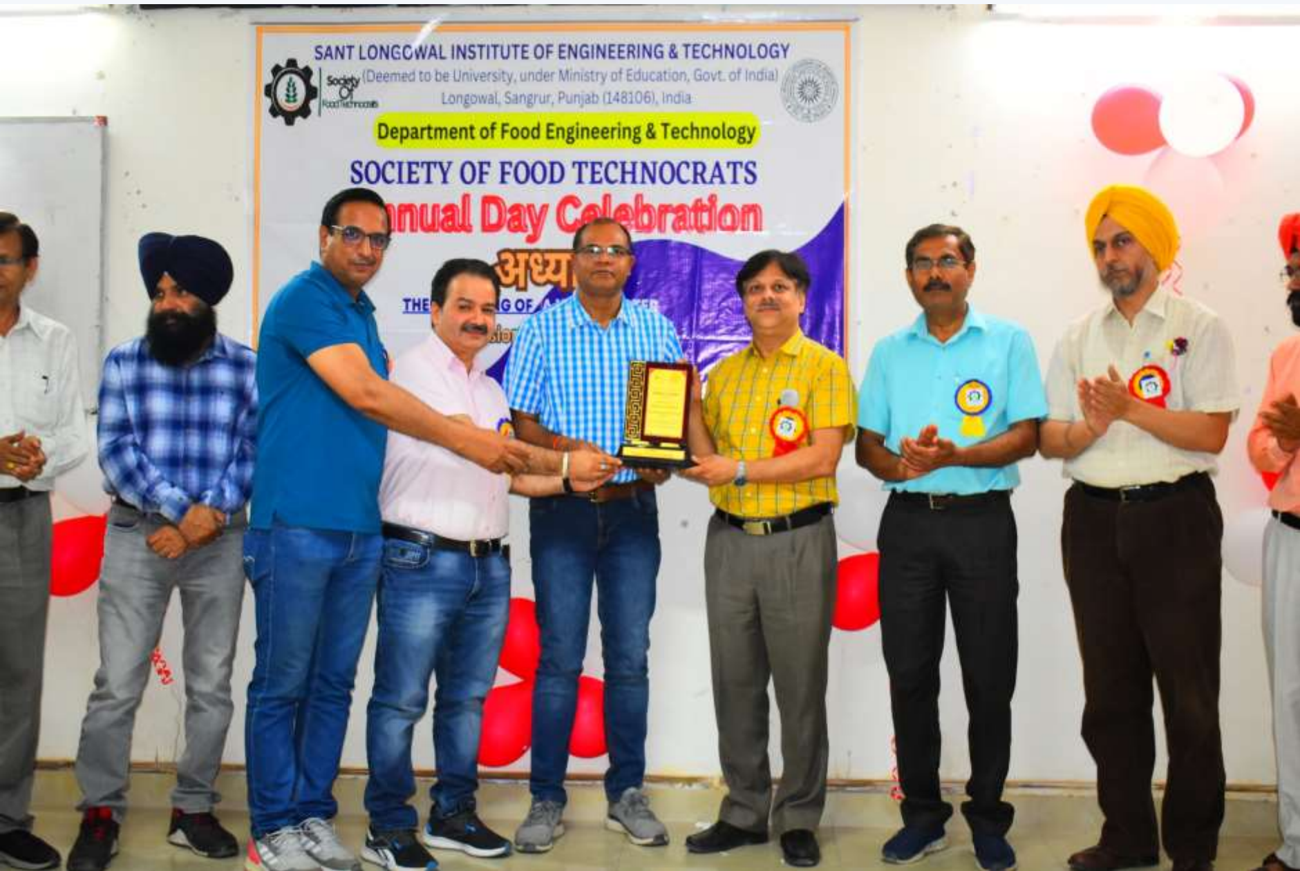
Felicitations of the Director by all the dignitaries.