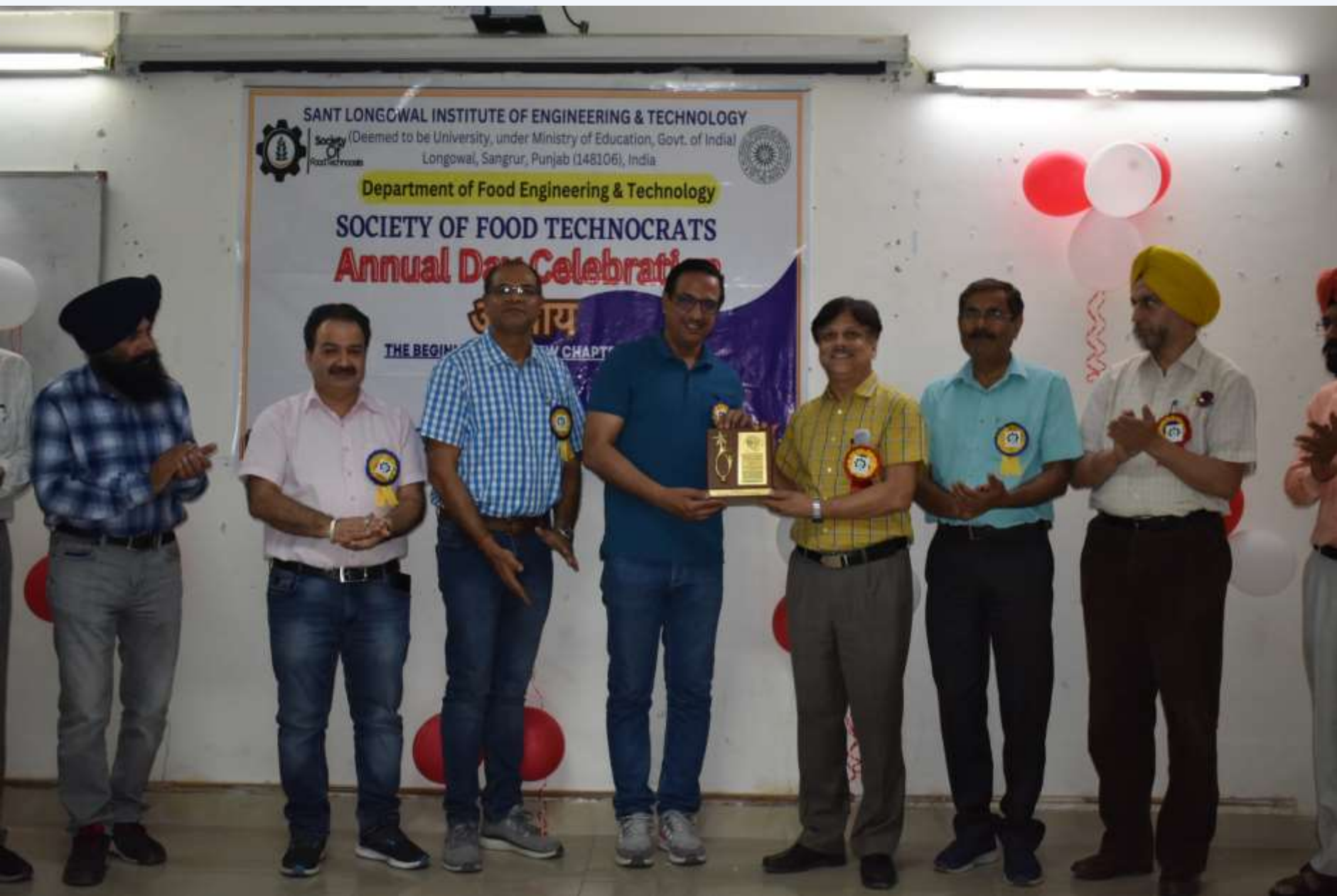
Felicitatation of HOD (FET) by the Director