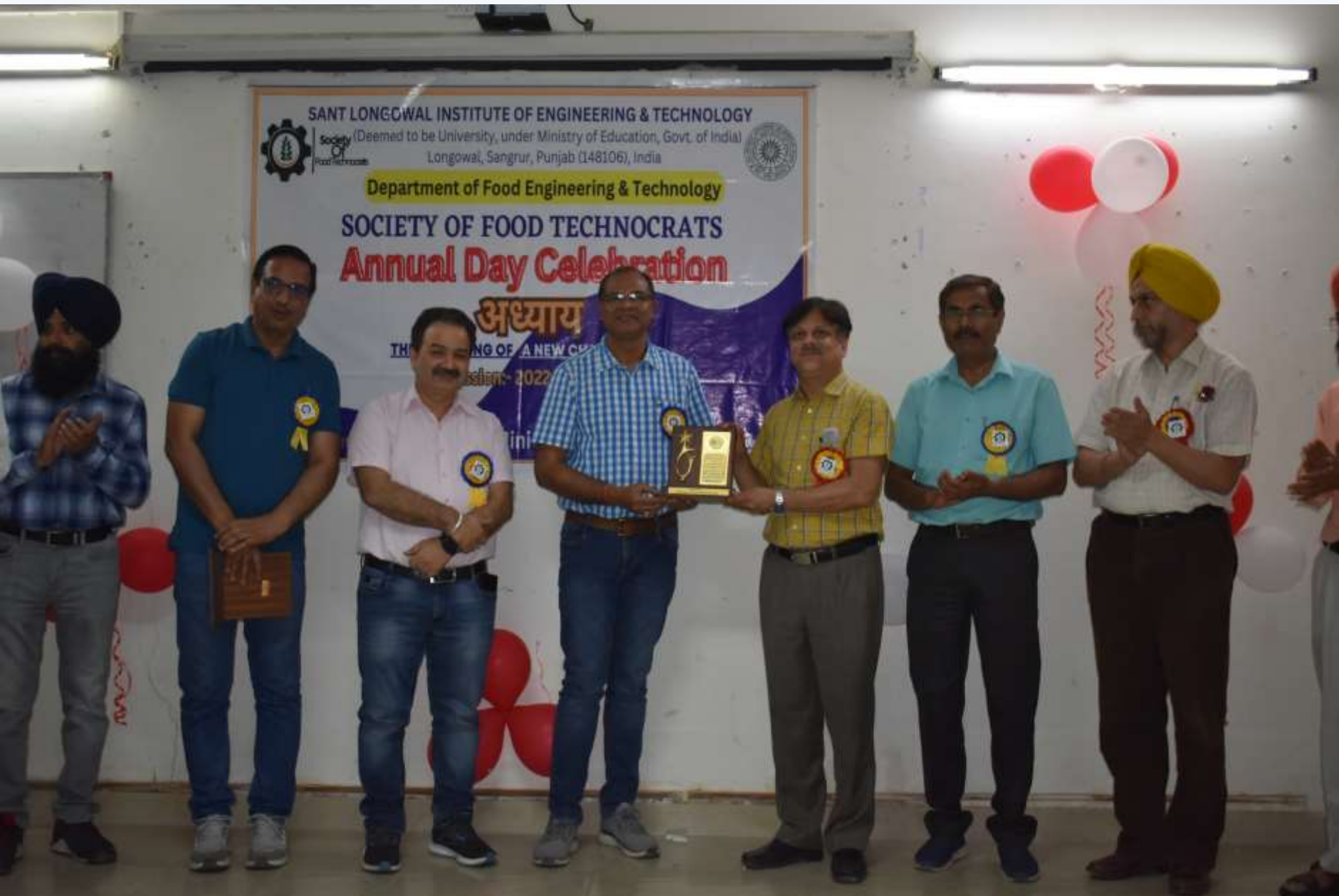
Felicitation of Faculty Advisor (SOFT) by the Director