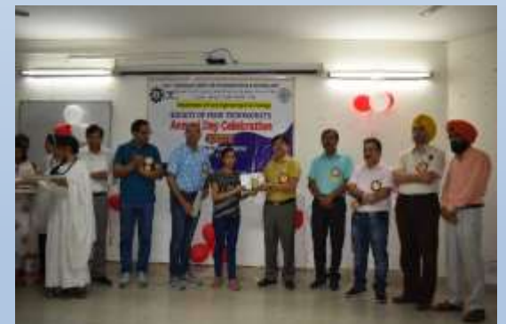
Prize Distribution Ceremony for both ICD & UG