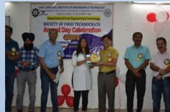
Prize Felicitation of Members of SOFT